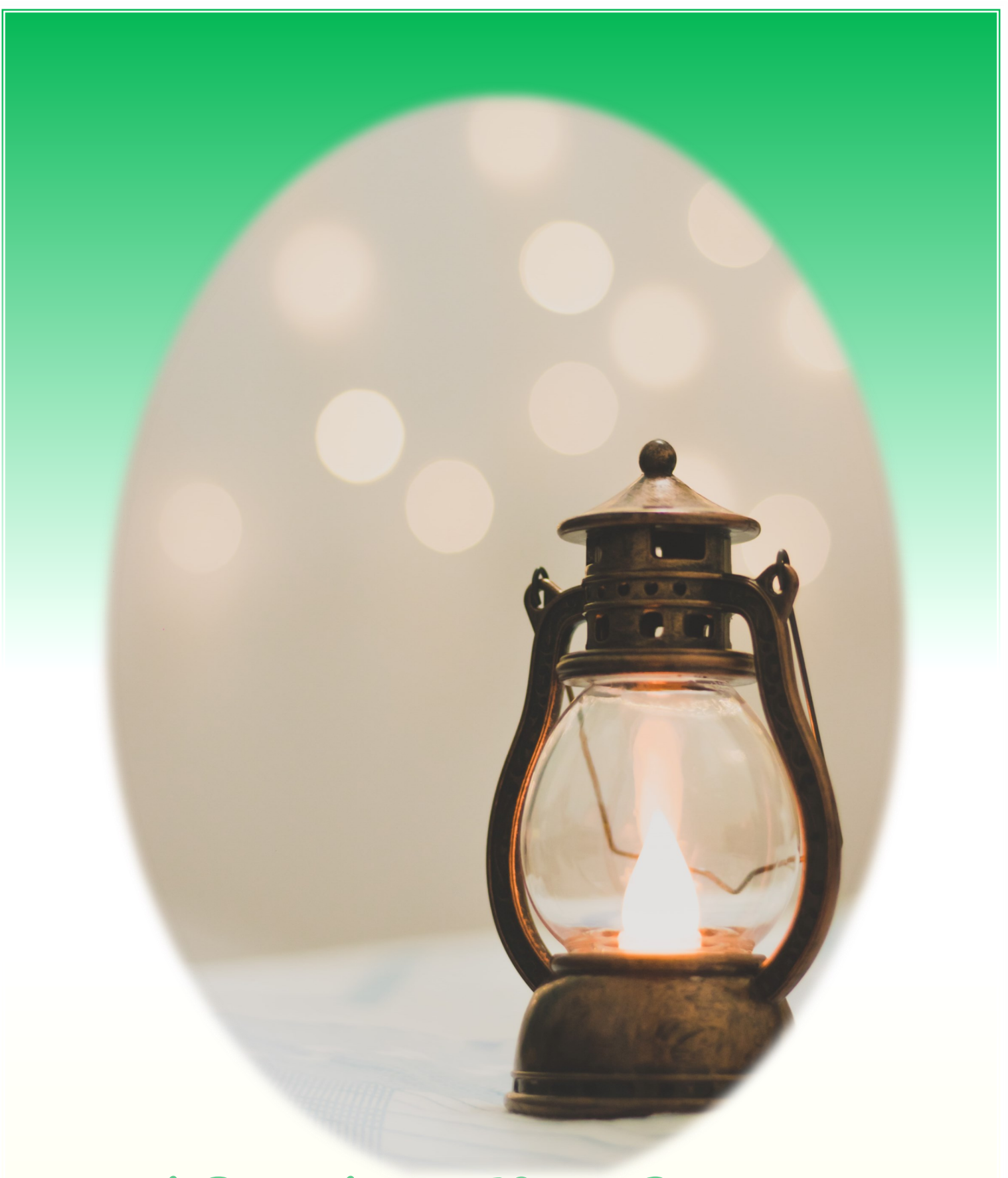
23rd Sunday After Pentecost November 8, 2020