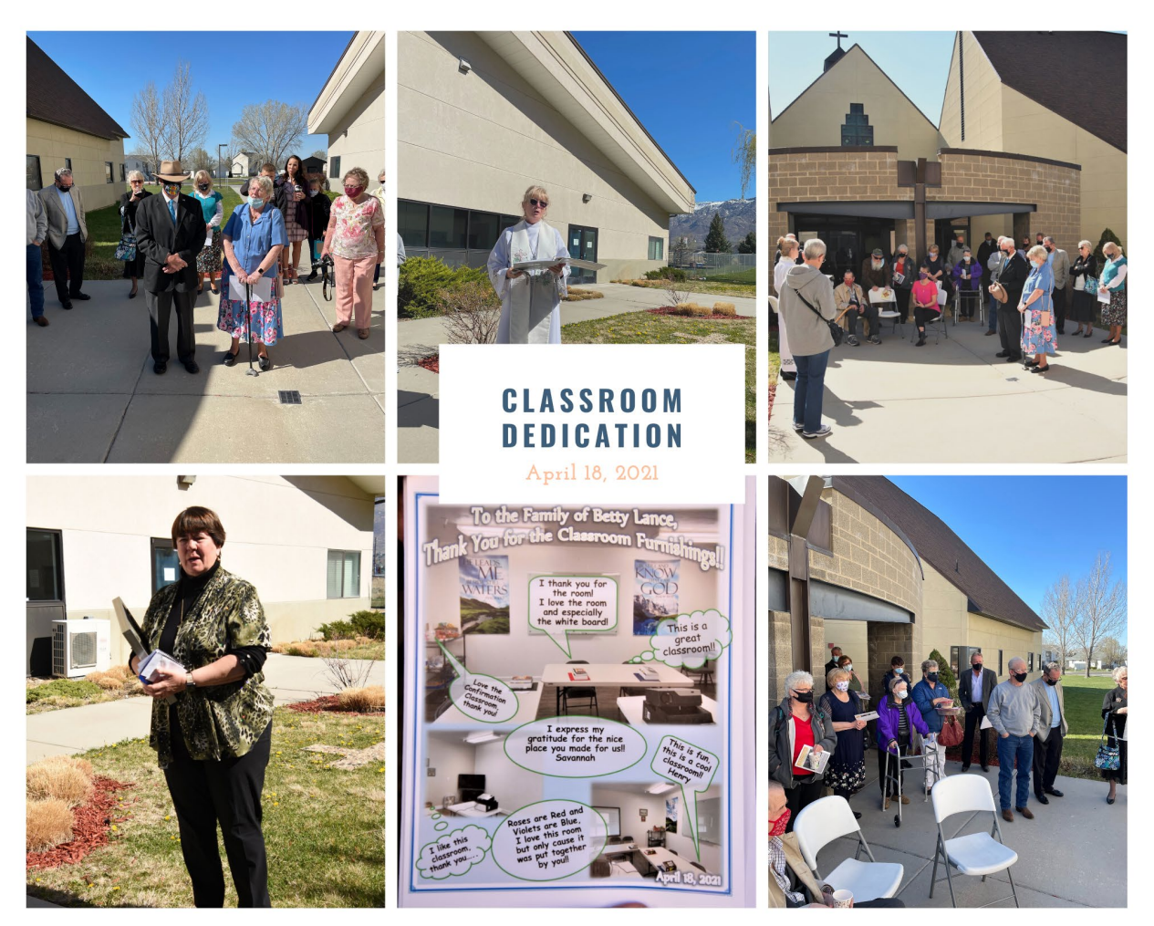
A few images of the celebration of the classroom dedication after worship last week.